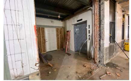
Above: New first floor opening to elevator lobby

Phase 9: The final phase includes the renovation of the balance of the existing 1st floor classroom wing, and miscellaneous exterior work on and around the building.