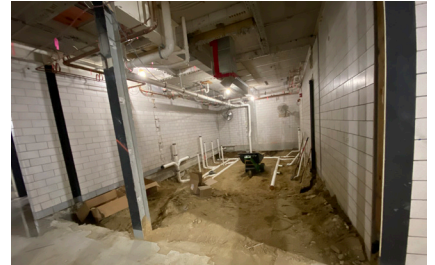
Above: New first floor subsurface plumbing