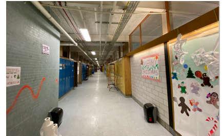
Above: Pre-demolition of first floor